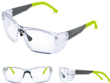
Hudson W3 CRYSTAL Size: 58-16-130