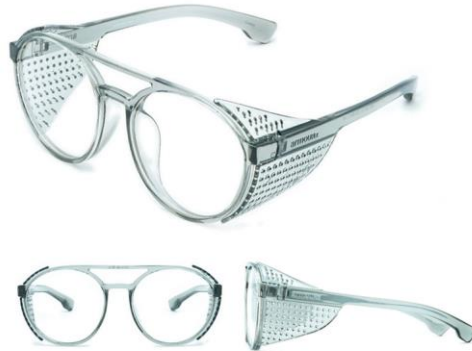
ARMOURX 5008 GREY Size: 57-18-140