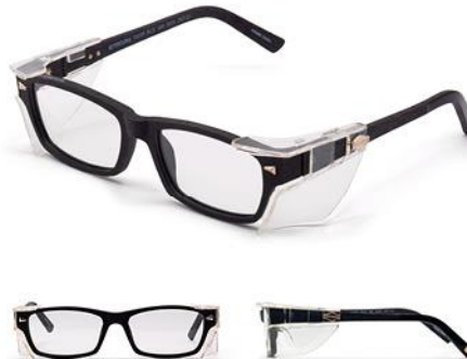
ArmouRx 7000P BLACK Size: 57-16-145

Sideshields: Integrated Removable and Replaceable Cushion