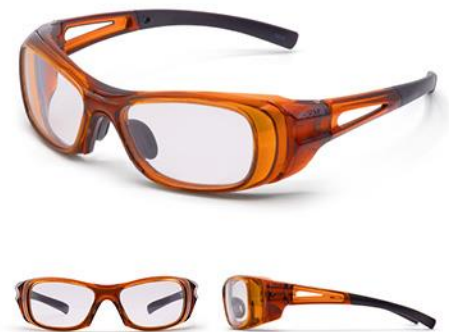
BOLLE SKATE TRANSLUCENT GREY TRANSLUCENT BROWN | BLACK Size: 52-18-120