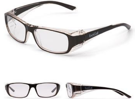
BOLLE B808 GUNMETAL | RED Size: 48-17-120; 54-17-120