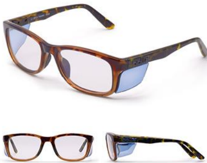
BOLLE KICK BLACK/GRAY | TORTOISE Size: 54-19-140