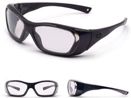
On Guard OG 210S OPAQUE BLACK Size: 57-16-120