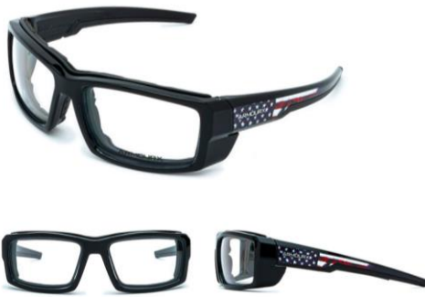
ArmouRx 6014 BLACK/USA Size: 60-16-129