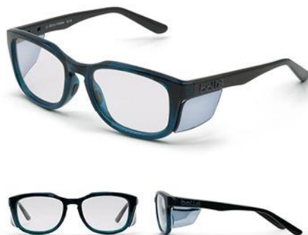
BOLLE SPICY BLACK/BLUE | BLACK/GREEN Size: 53-19-138