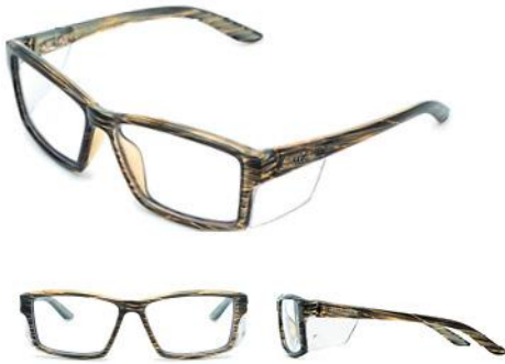
ARMOURX 5006 BROWN Size: 56-14-143