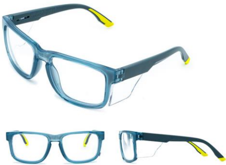
ArmouRx 7501 GREY Size: 57-18-145